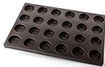
mold bottom with hole