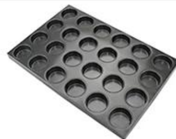
round tray corner