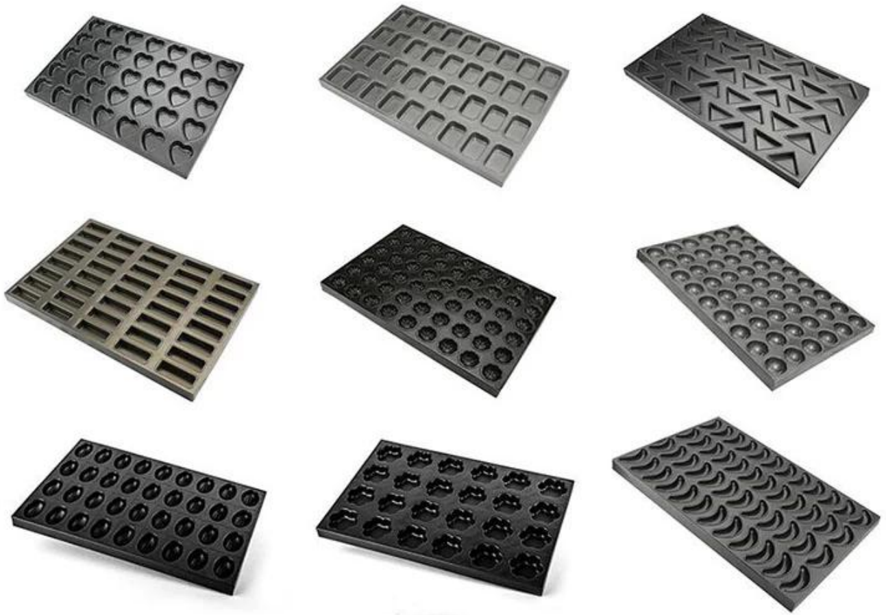
Our baking pans showing room