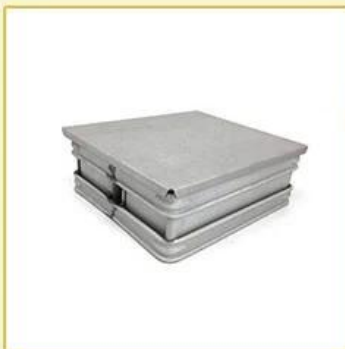
2 straps with lid