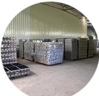
Clean & tidy warehouse