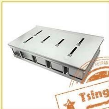
4/5 straps with lid

Available for food factory machinery lines