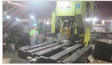
Automatic punching machine