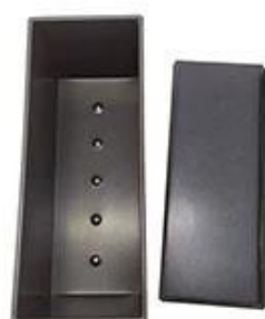
holes at bottom