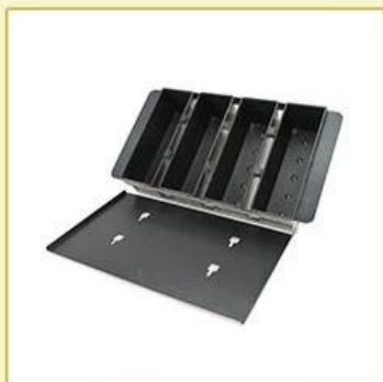
with buckled lid