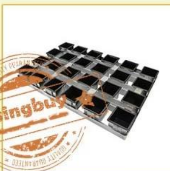
24 toast boxes