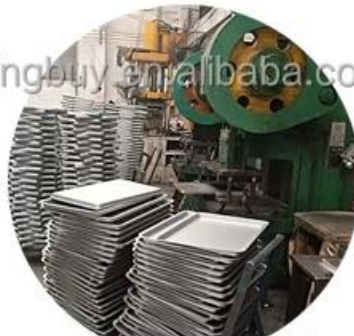
Standard production flow