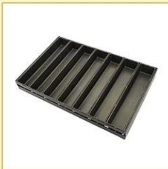
7 long straps