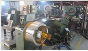
Automatic cutting machine