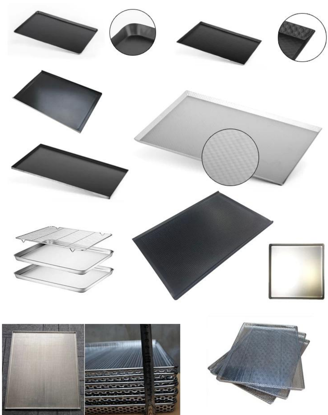
Factory pictures of Tsingbuy commercial baking tray sheet pan manufacturer