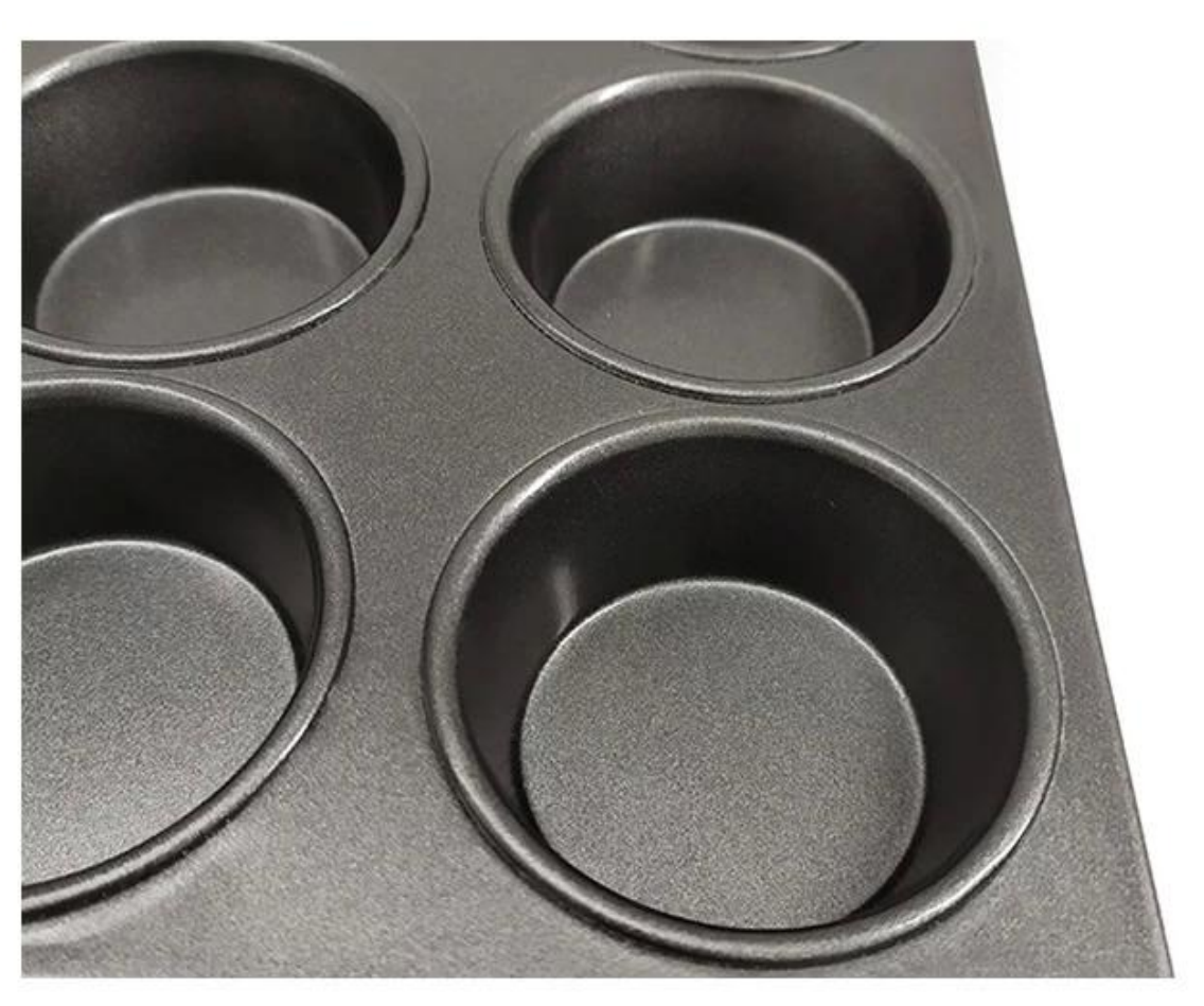
More types of shaped cupcake pans