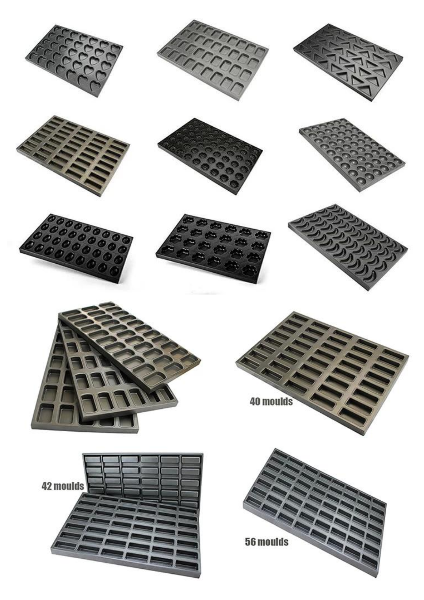
Non-stick muffin tray factory pictures and showing room