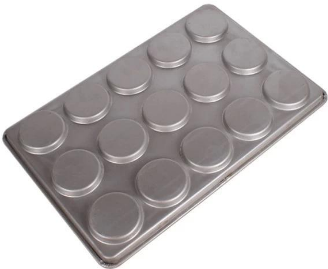
OEM Industry Cup Tray Customization from Multi-mould pan manufacturer in China