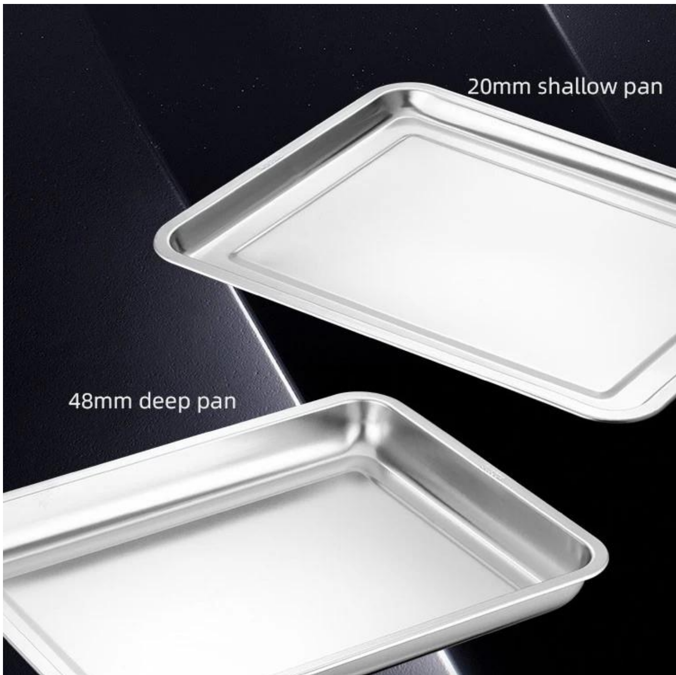
48mm deep pan