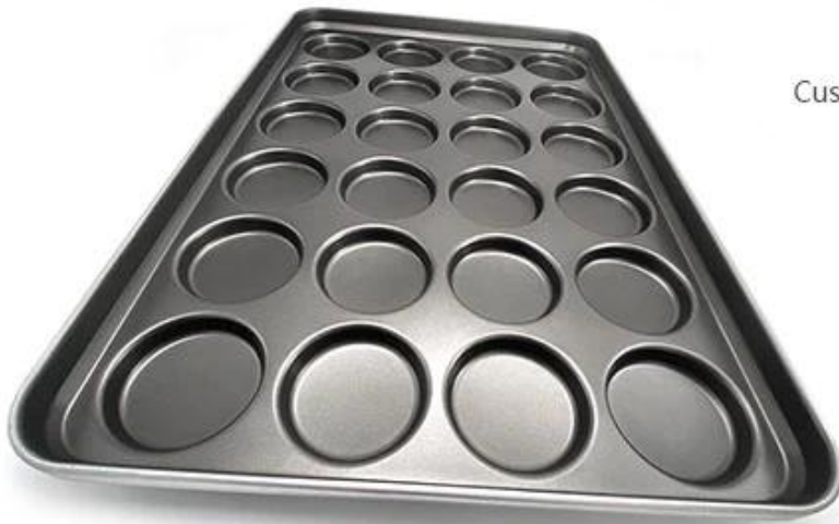
Custom 24-molds hamburger baking pan