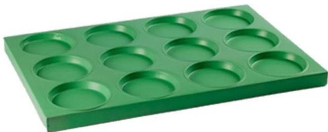
15-mold round muffin pan/ hamburger pan