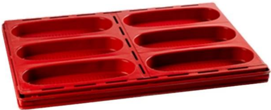
6-mold hot-dog bun bread mold pan / mini baguette bread mold pan