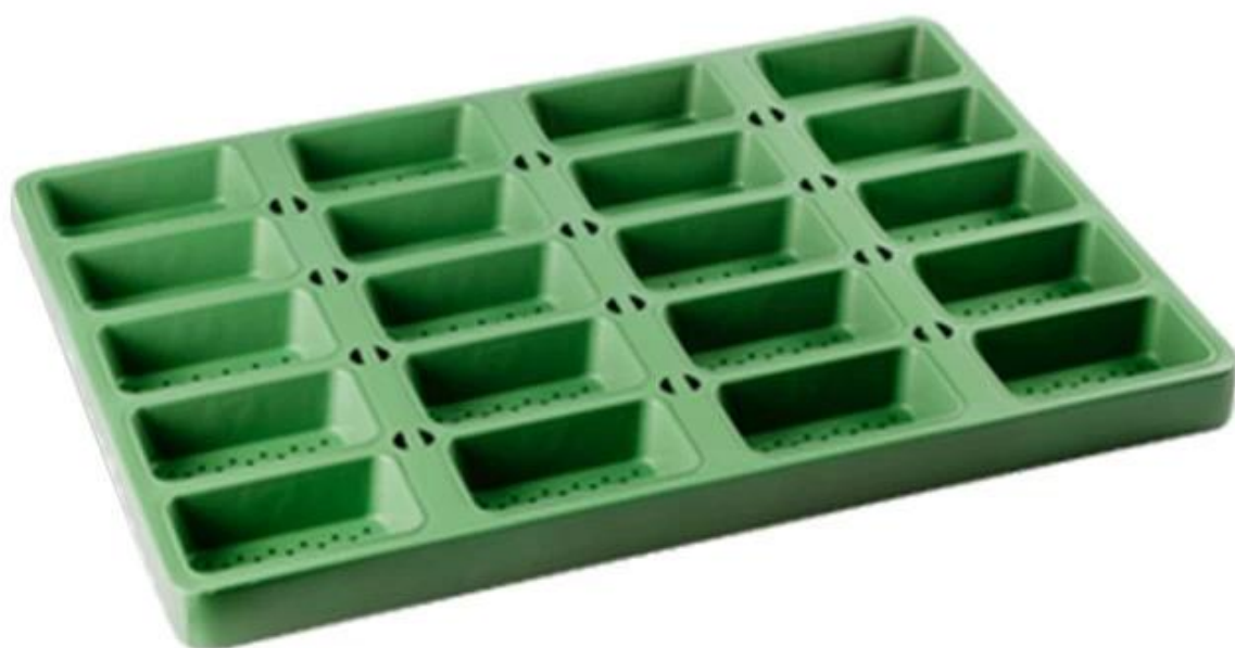
25-mold rectangle cupcake pan / mini loaf bread mold