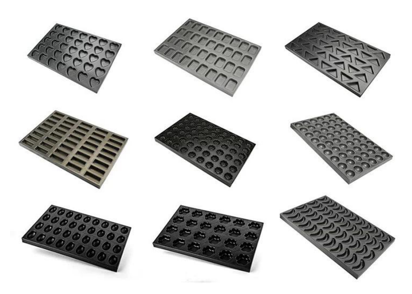
Industry cup tray, baking pans showing room