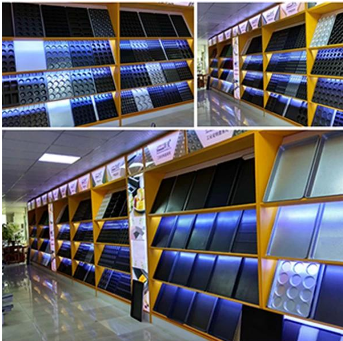
Customer Visiting baking tray factory in China