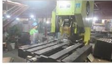
Automatic punching machine