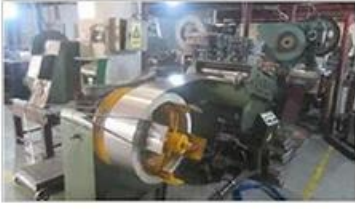
Automatic cutting machine