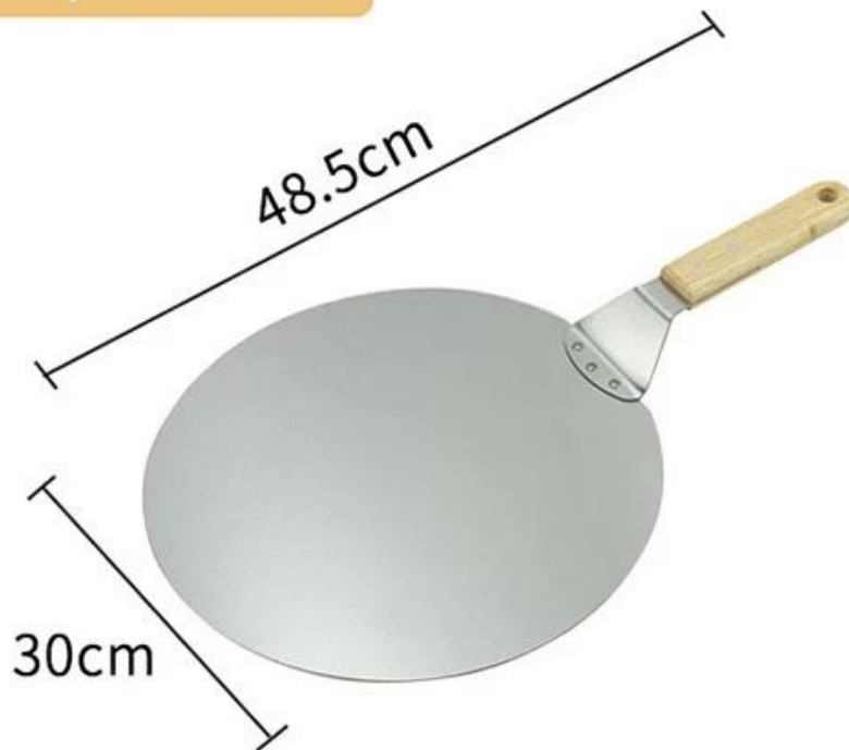
12 inch pizza shovel