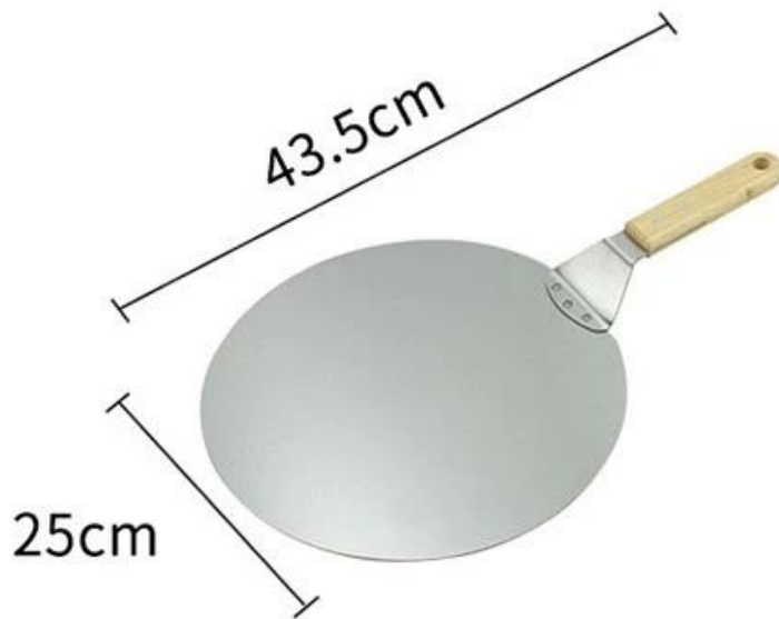
10 inch pizza shovel