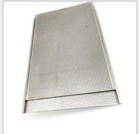
sheet pan with lid