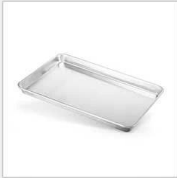
wire in rim