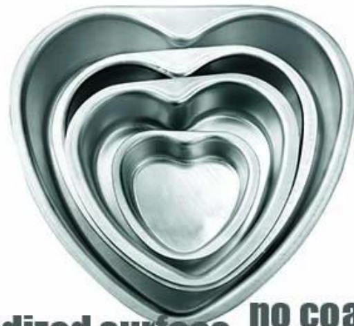
anodized surface no coating