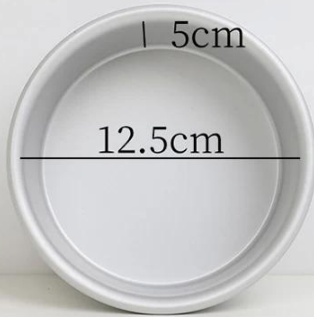
5 inch round cake mold