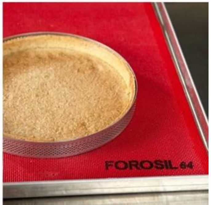
Mga Produkto Mga Larawan :