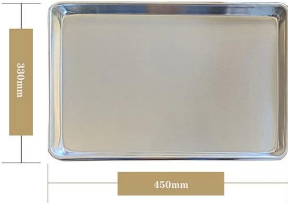
Half size baking sheet pan