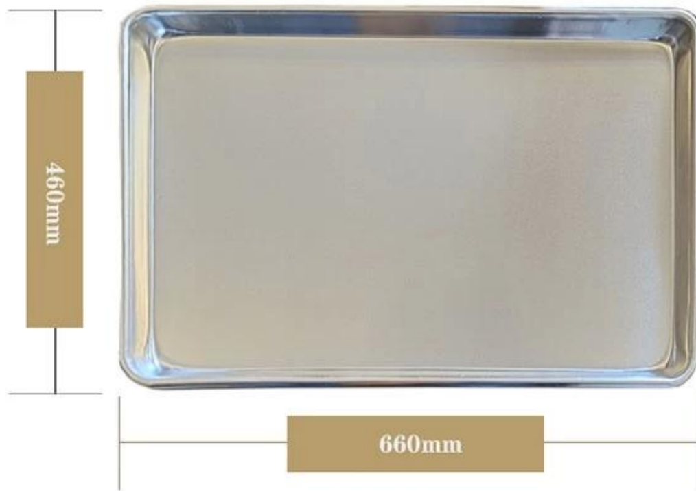
Full size baking sheet pan