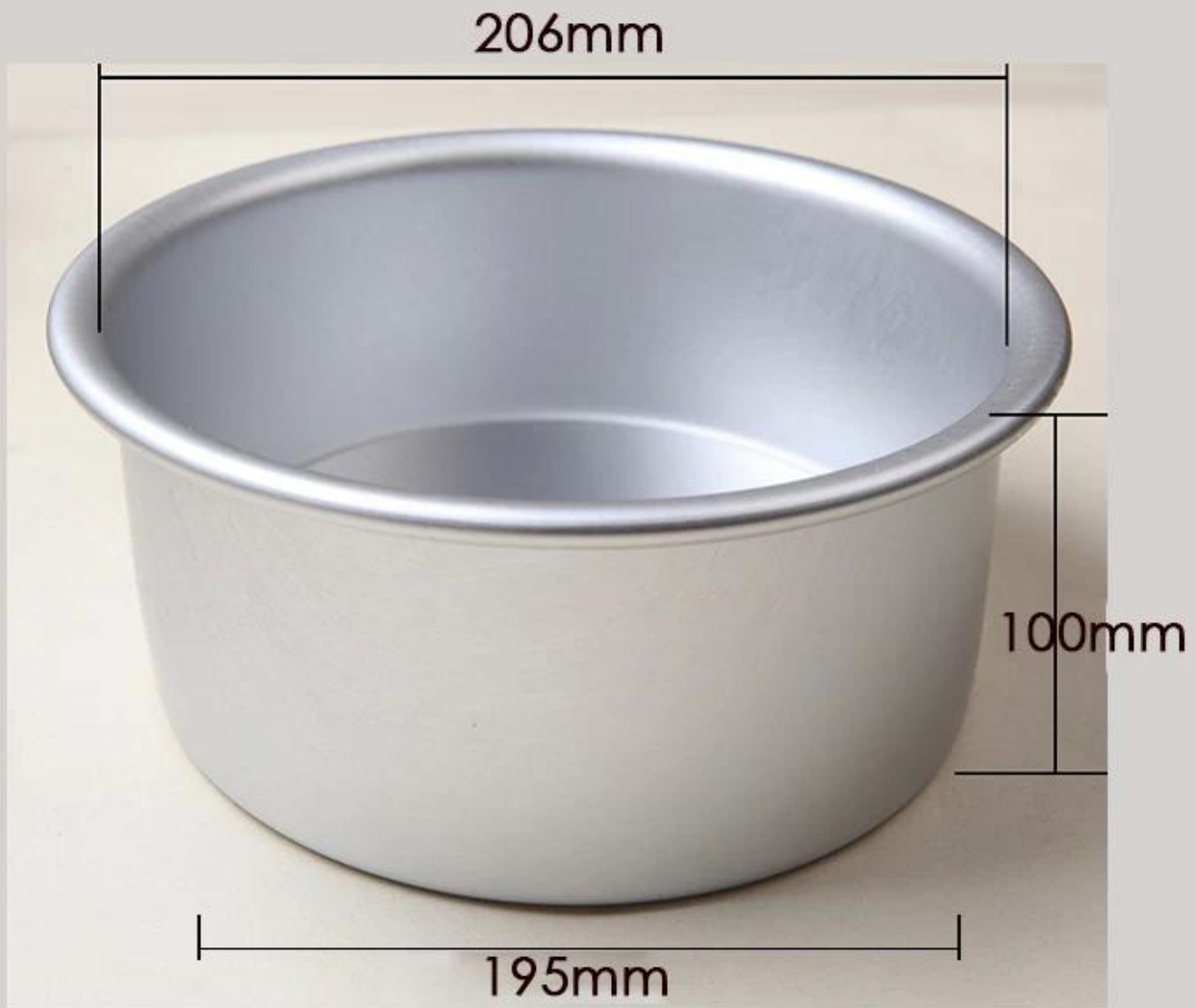
8" Deep Cake Pan weight: 290g