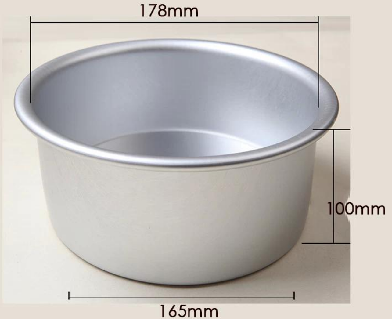
7" Deep Cake Pan weight: 230g