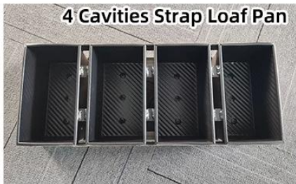
4 Cavities Strap Loaf Pan