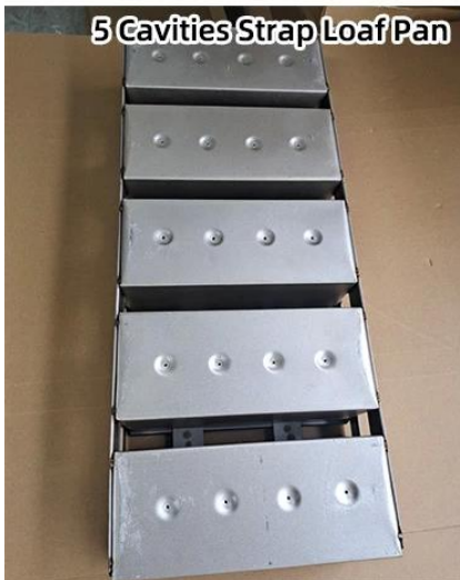
5 Cavities Strap Loaf Pan