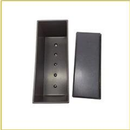
holes at bottom