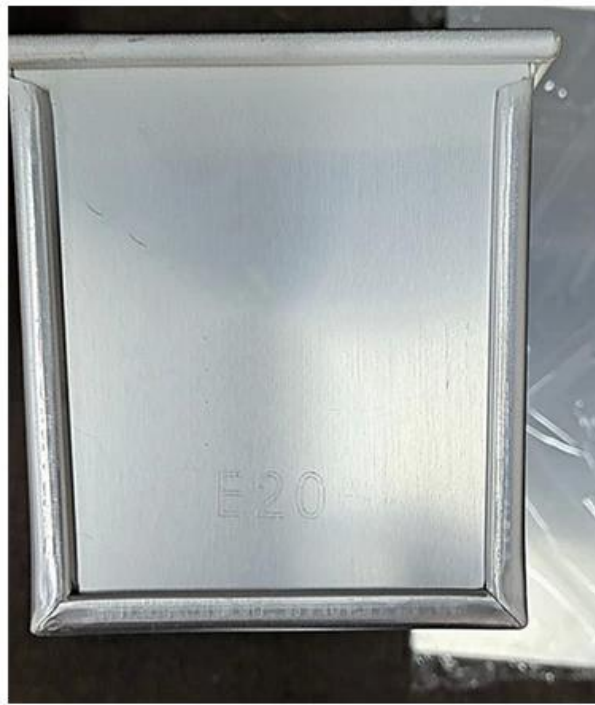
Holes at bottom