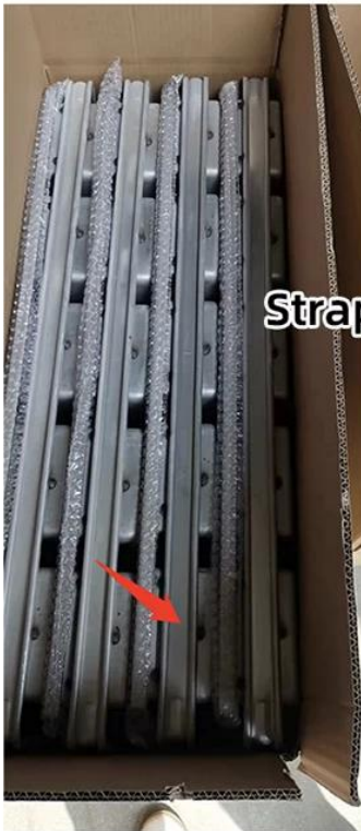
Strap Loaf Pans