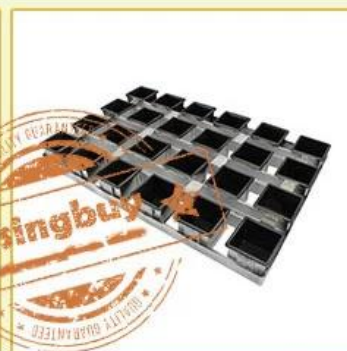
24 toast boxes