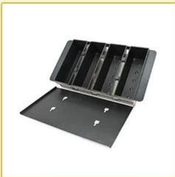
with buckled lid