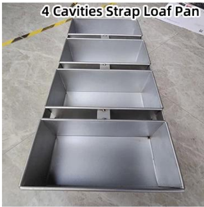
4 Cavities Strap Loaf Pan