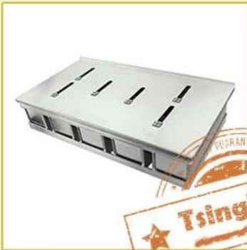
4/5 straps with lid

Available for food factory machinery lines