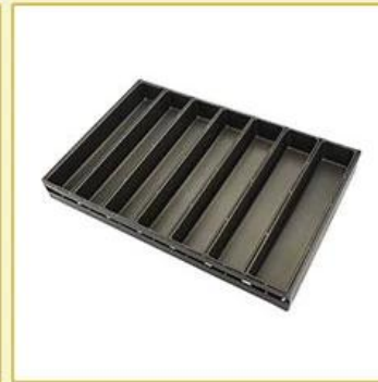
7 long straps