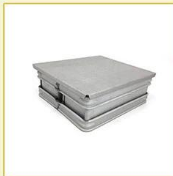
2 straps with lid