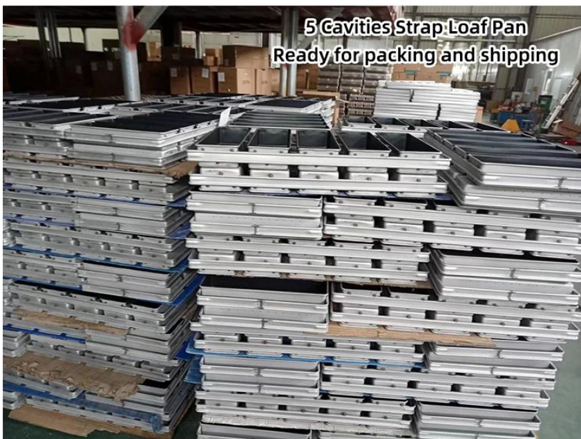
5 Cavities Strap Loaf Pan Ready for packing and shipping