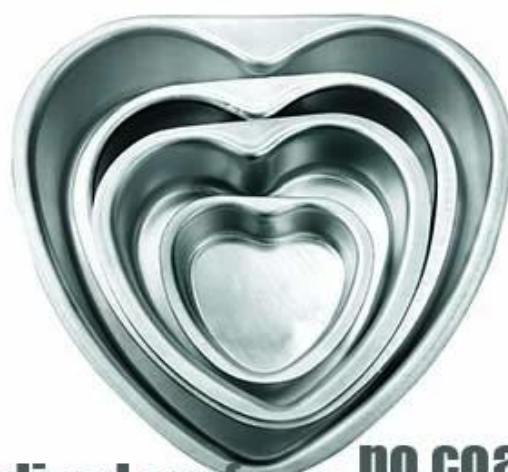
anodized surface no coating