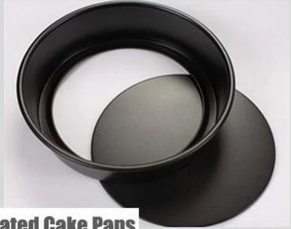
Non-stick Coated Cake Pans