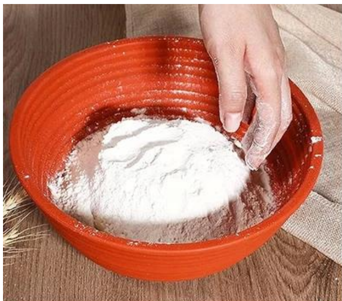
1. Sprinkle flour on the proofing basket