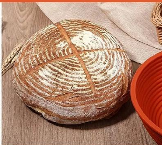
4. Bake the dough and enjoy it