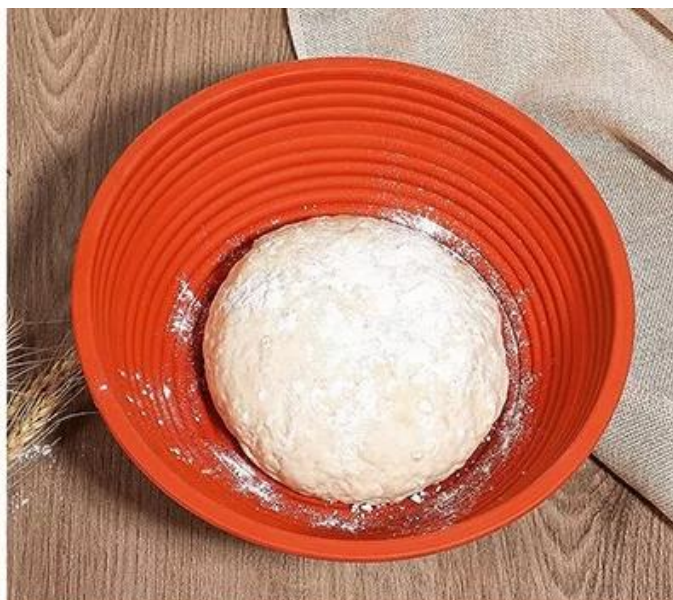
2. Place the dough in the basket