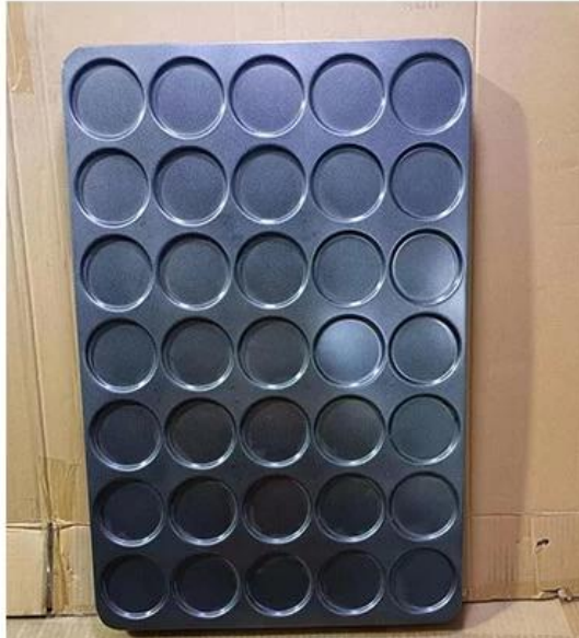
Large size for industrial use