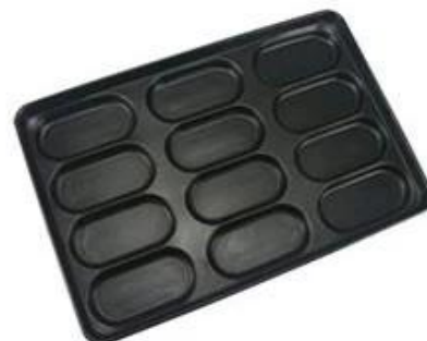
custom mould size