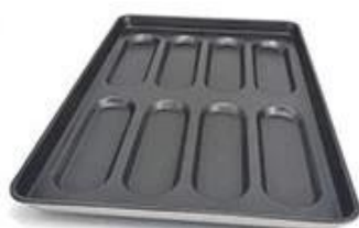
hot dog bun pan