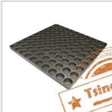
holes for air flow