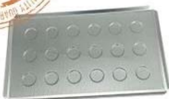
perforated tart mould