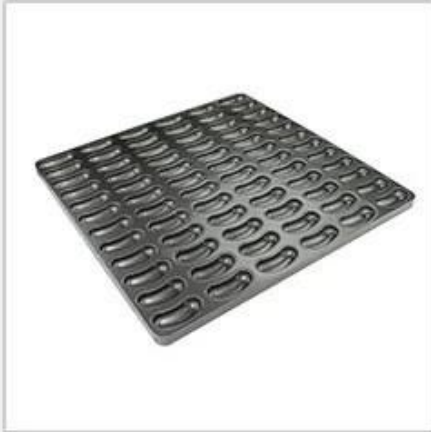
hot dog moulds