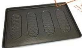
perforated & oval