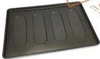
perforated & oval