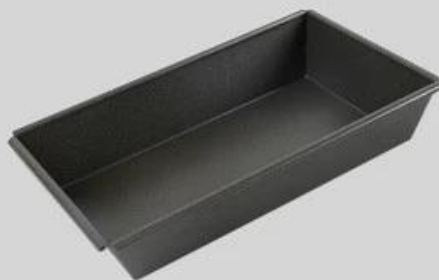
Double side PTFE nonstick