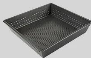
Double side Hardening nonstick Perforated