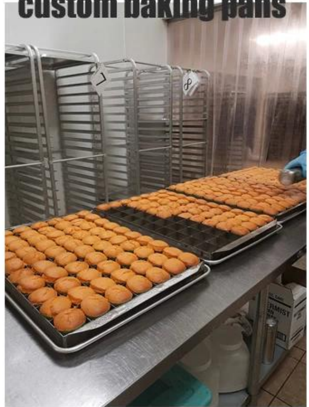
Use in Food Factory