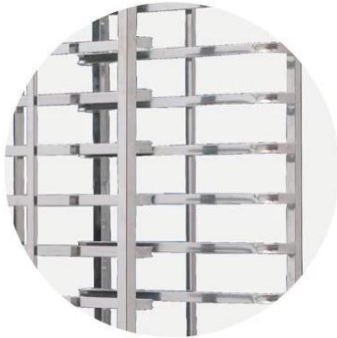
stainless steel tube material for holding trays