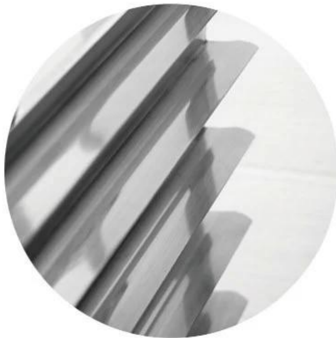
L Shaped Stainless Steel Sheet for Holding Trays