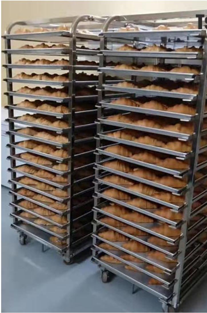
Tsingbuy Bakery Trolley custom baking pans