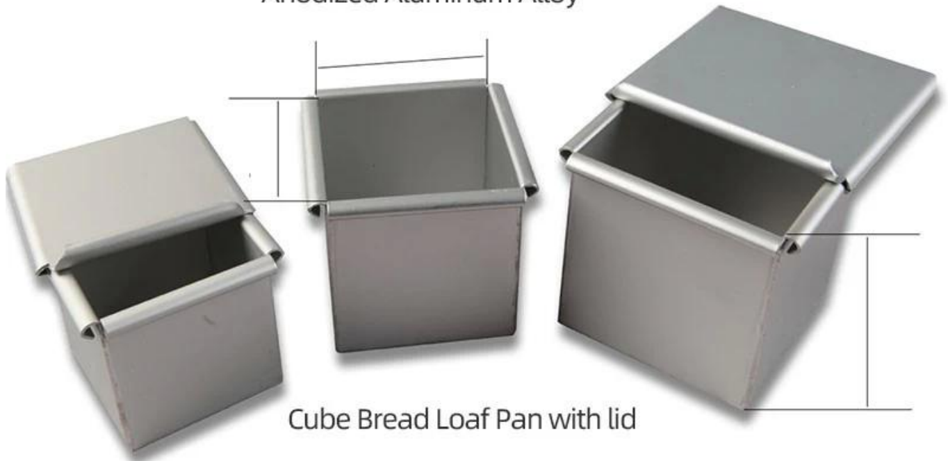
Cube Bread Loaf Pan with lid