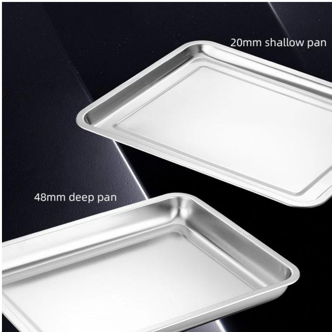
48mm deep pan