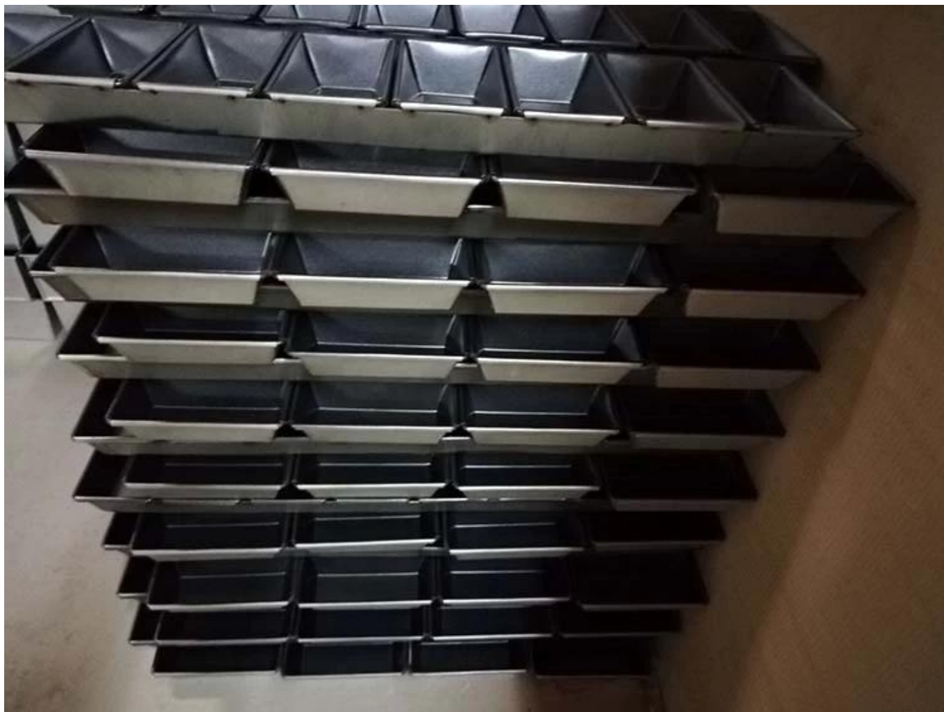
Factory pictures from strap loaf pan supplier