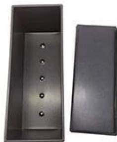
holes at bottom