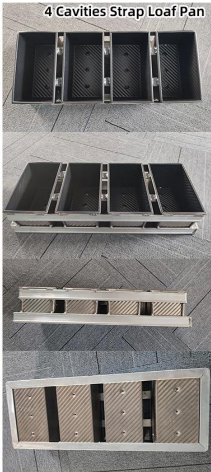
4 Cavities Strap Loaf Pan