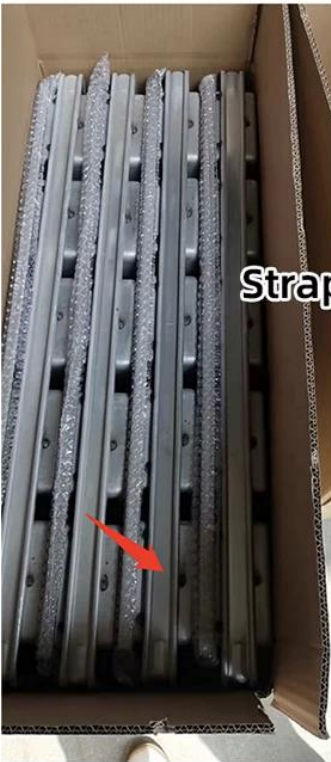
Strap Loaf Pans