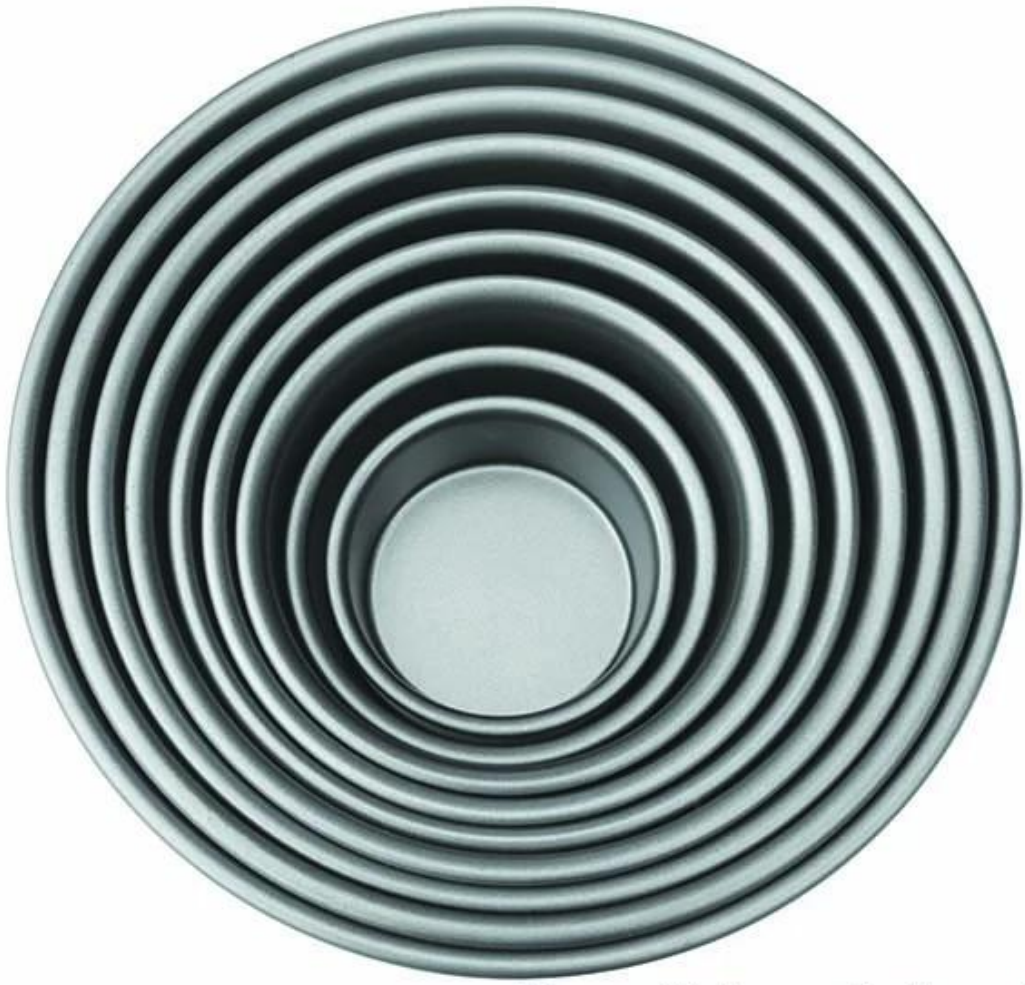
Non-stick costed surface