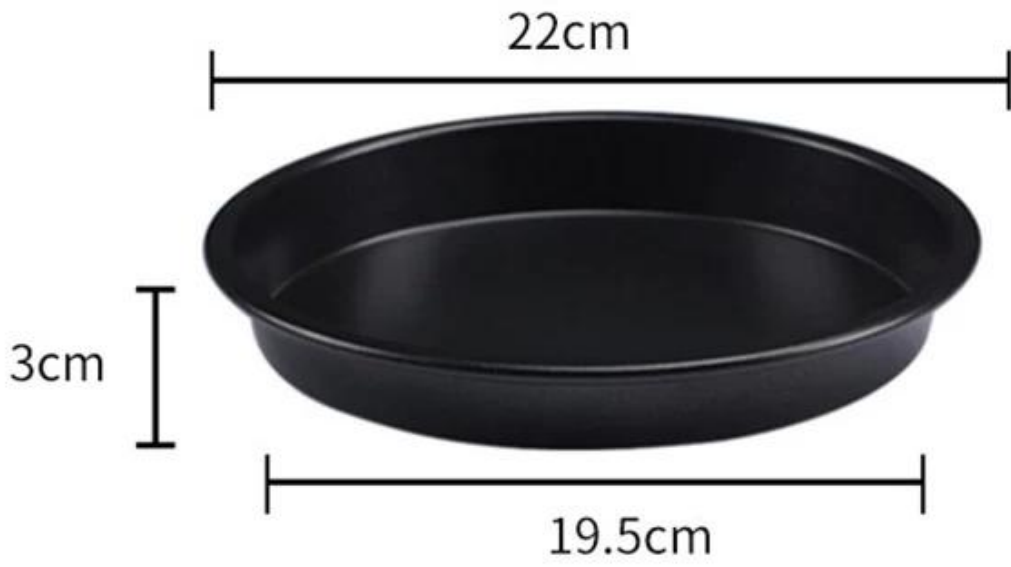
8 inch deep pizza tray