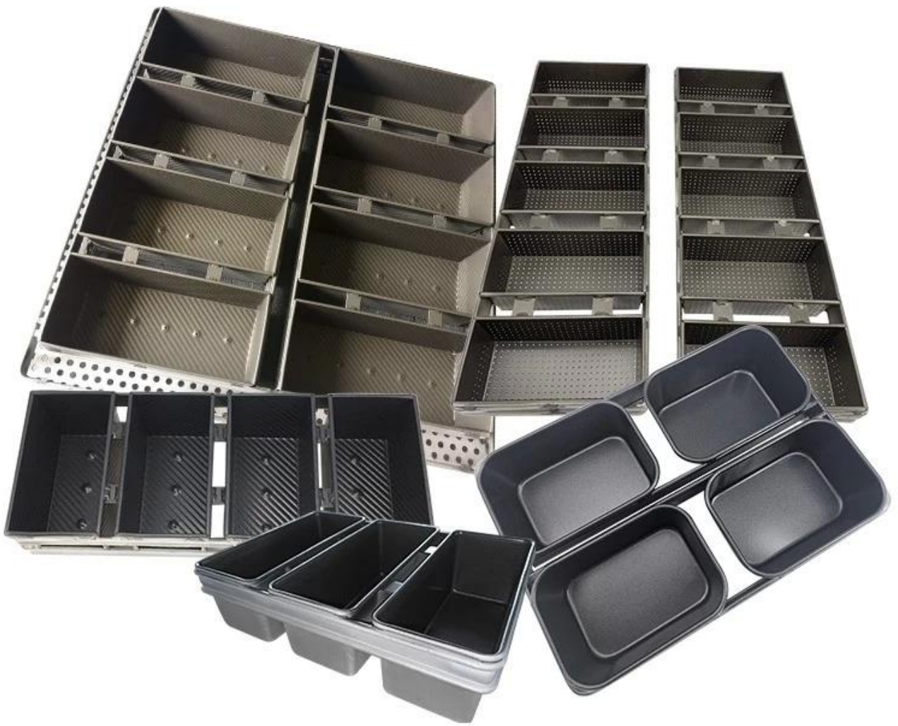
Tsingbuy loaf & bread pan factory pictures