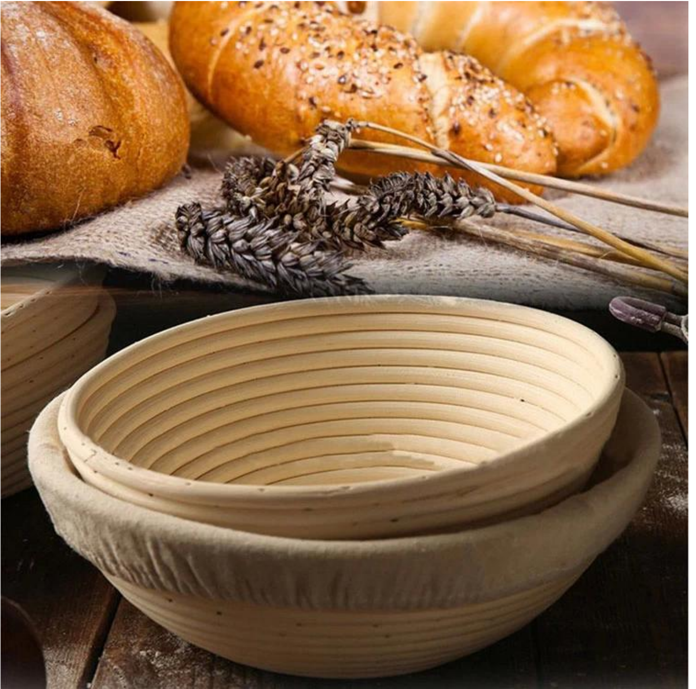
Banneton basket factory pictures