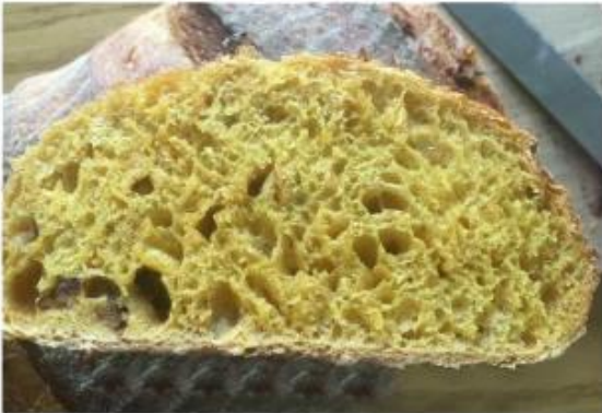
using baking pizza stone