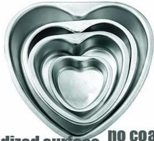
anodized surface no coating