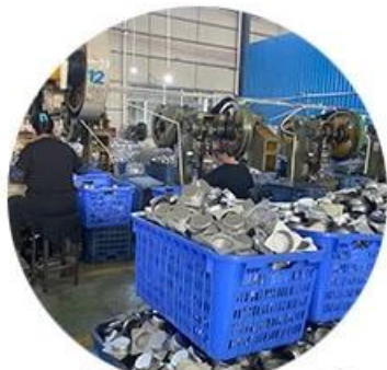
Quick production fast dispatch