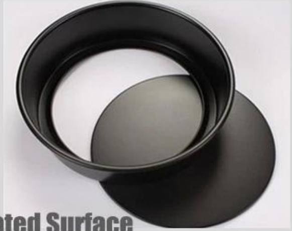
Teflon Coated Surface