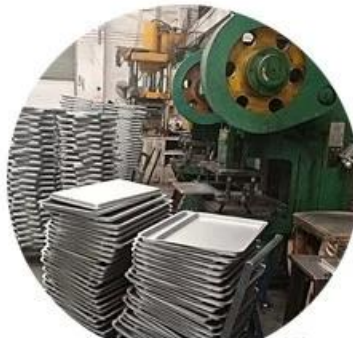
Standard production flow