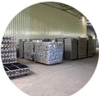
Clean & tidy warehouse