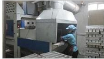
Sand blasting machine