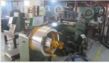
Automatic cutting machine