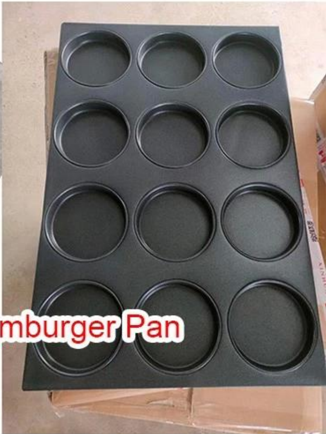
Custom Made Hamburger Pan