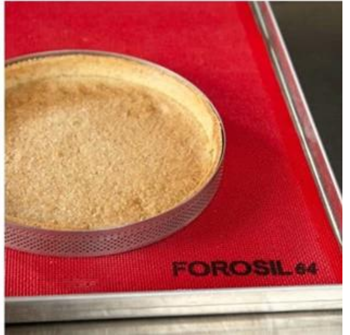
Products Pictures :