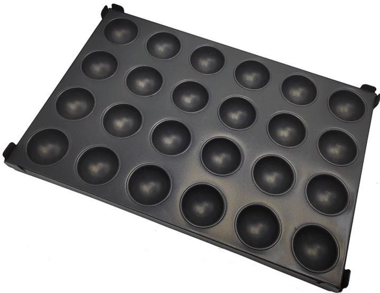
More half ball hemisphere cake baking mold bakery oven tray