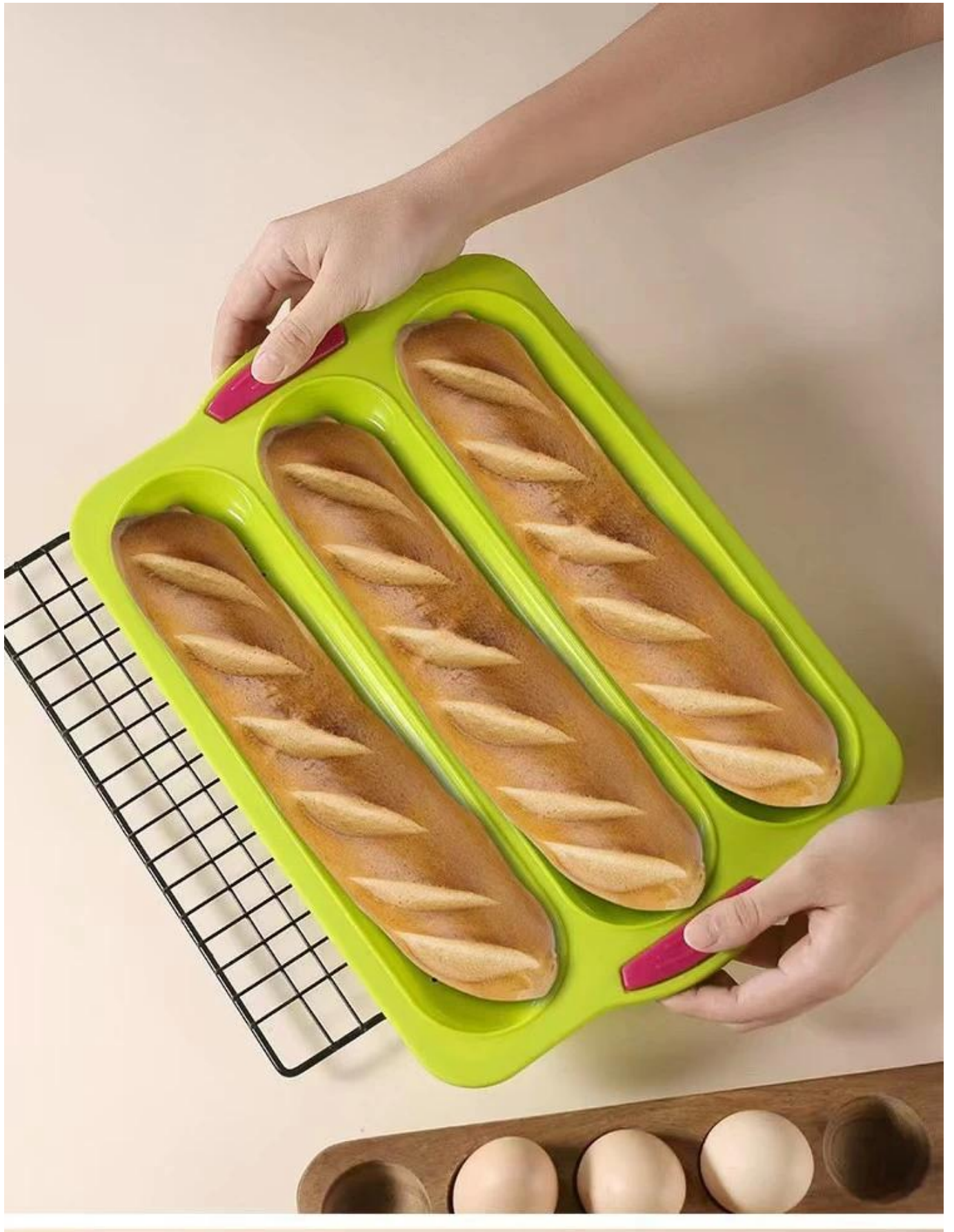
Other new material silicone bakeware products