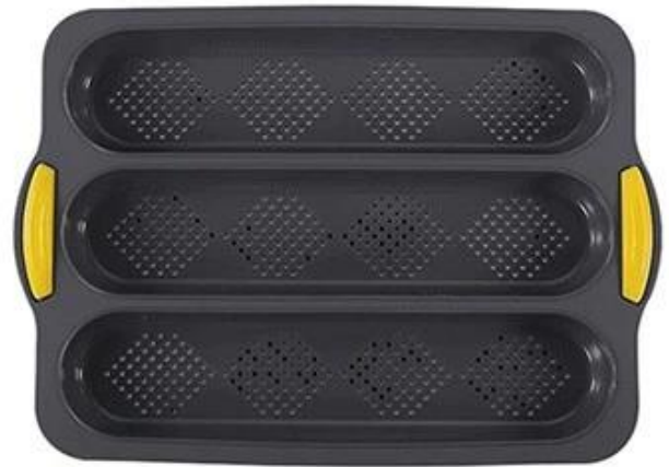
dark grey with orange handle