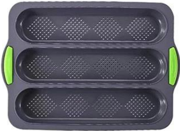
dark grey with green handle