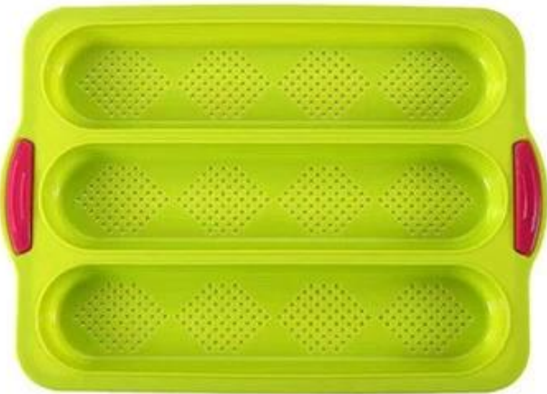
green with red handle