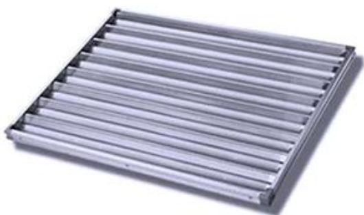
8 baguettes non-stick