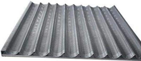
10 baguettes non-stick