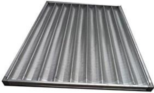
9 baguettes non-stick