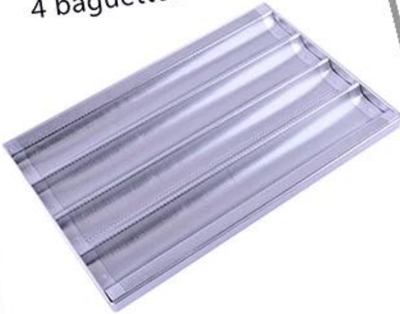
4 baguettes non-stick