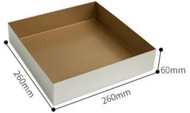
welded right corner