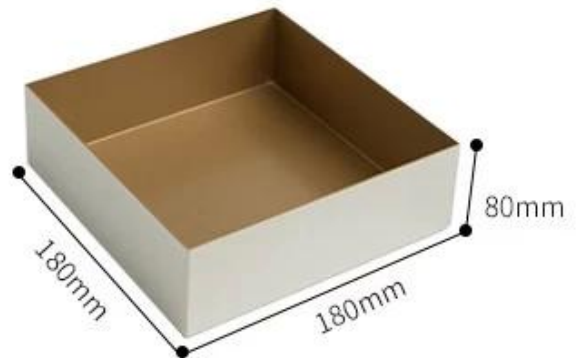
welded right corner