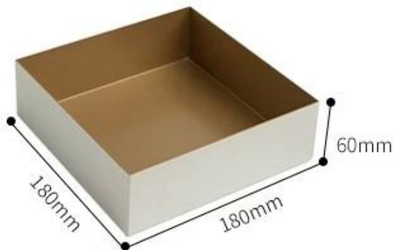
welded right corner