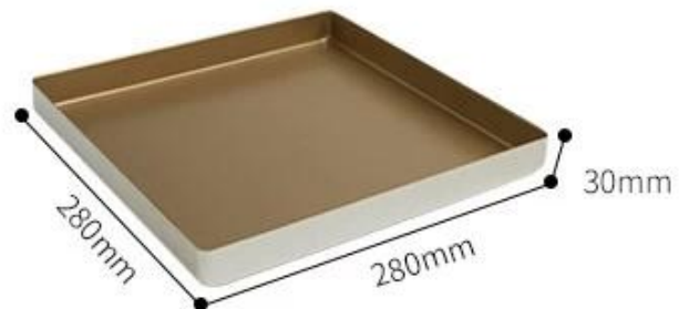
Stamp round corner