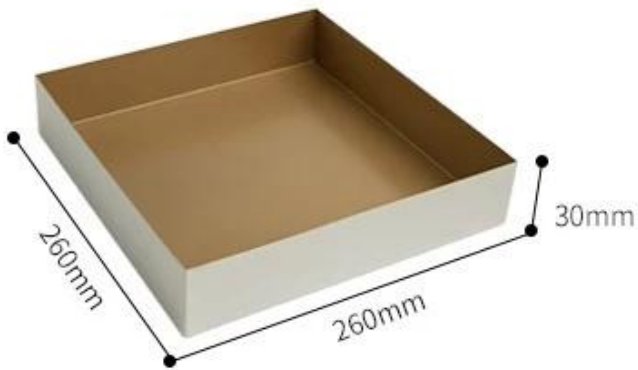
welded right corner