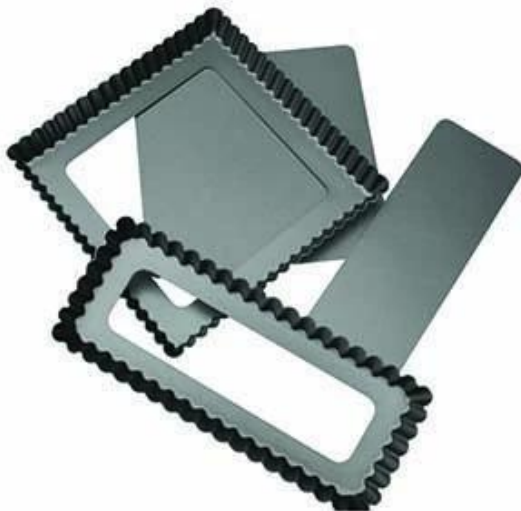
Detachable / removable bottom