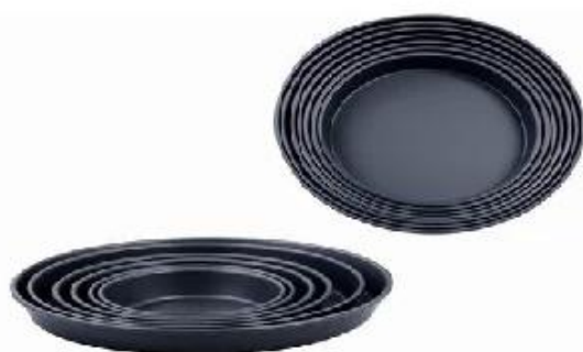
non-stick pizza pan