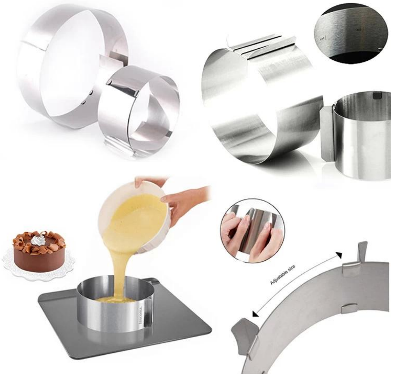
Details of adjustable stainless steel mousse ring