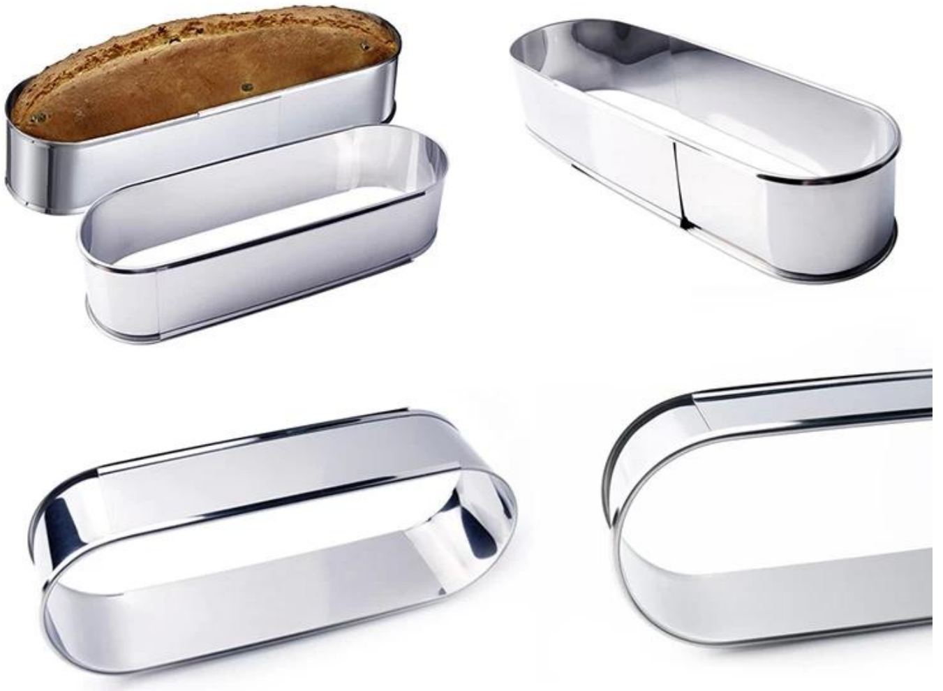
Rectangle shape of adjustable stainless steel mousse ring