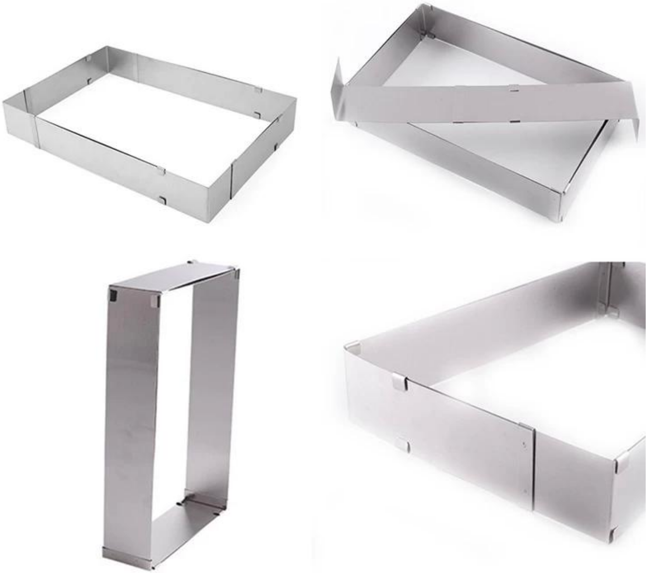
Square shape of adjustable stainless steel mousse ring