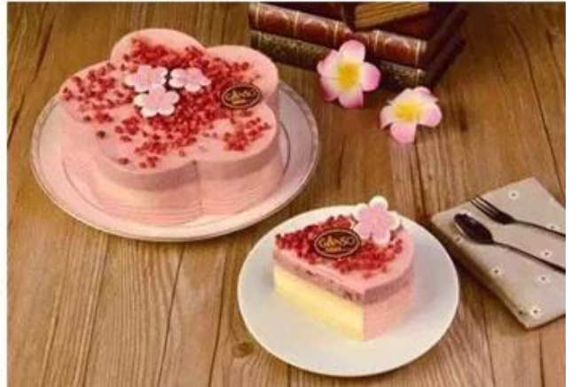
More patterns of Mousse Ring from China mousse ring manufacturer