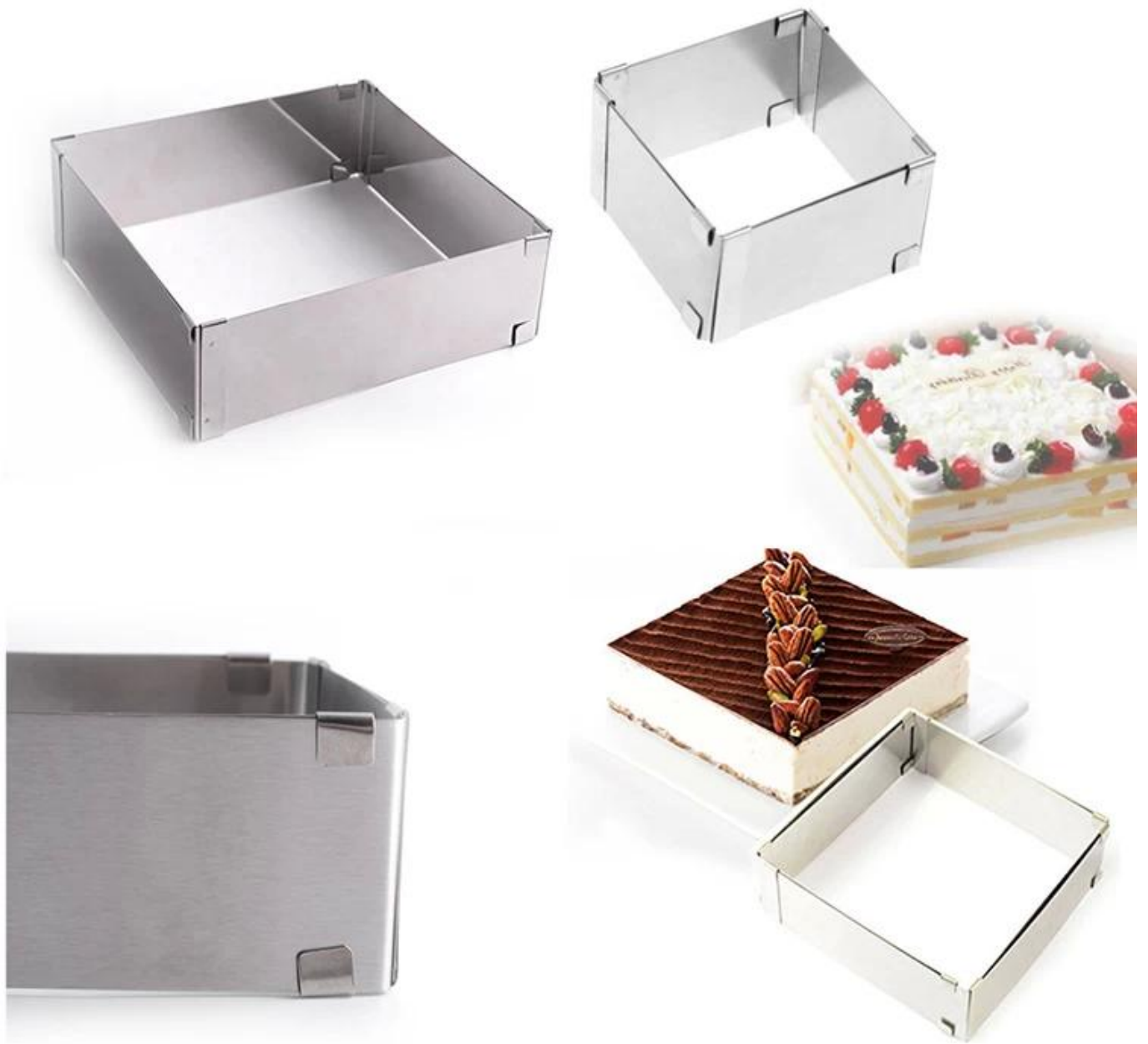
Round shape of adjustable stainless steel mousse ring