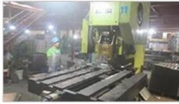
Automatic punching machine