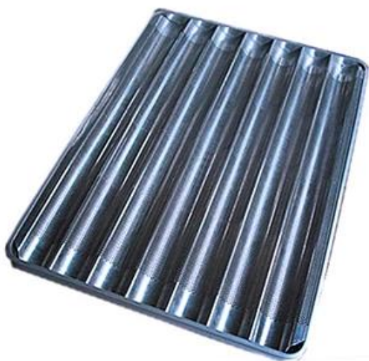
7 baguettes round corner