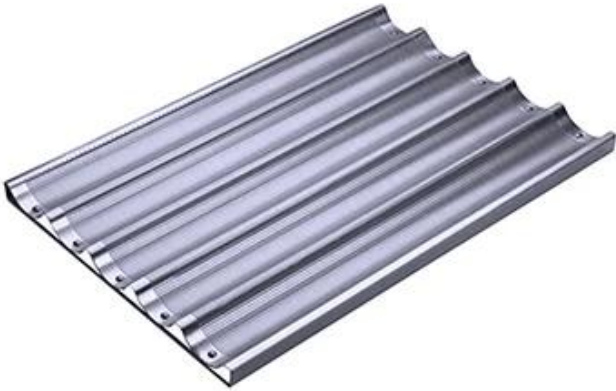
5 baguettes open frame