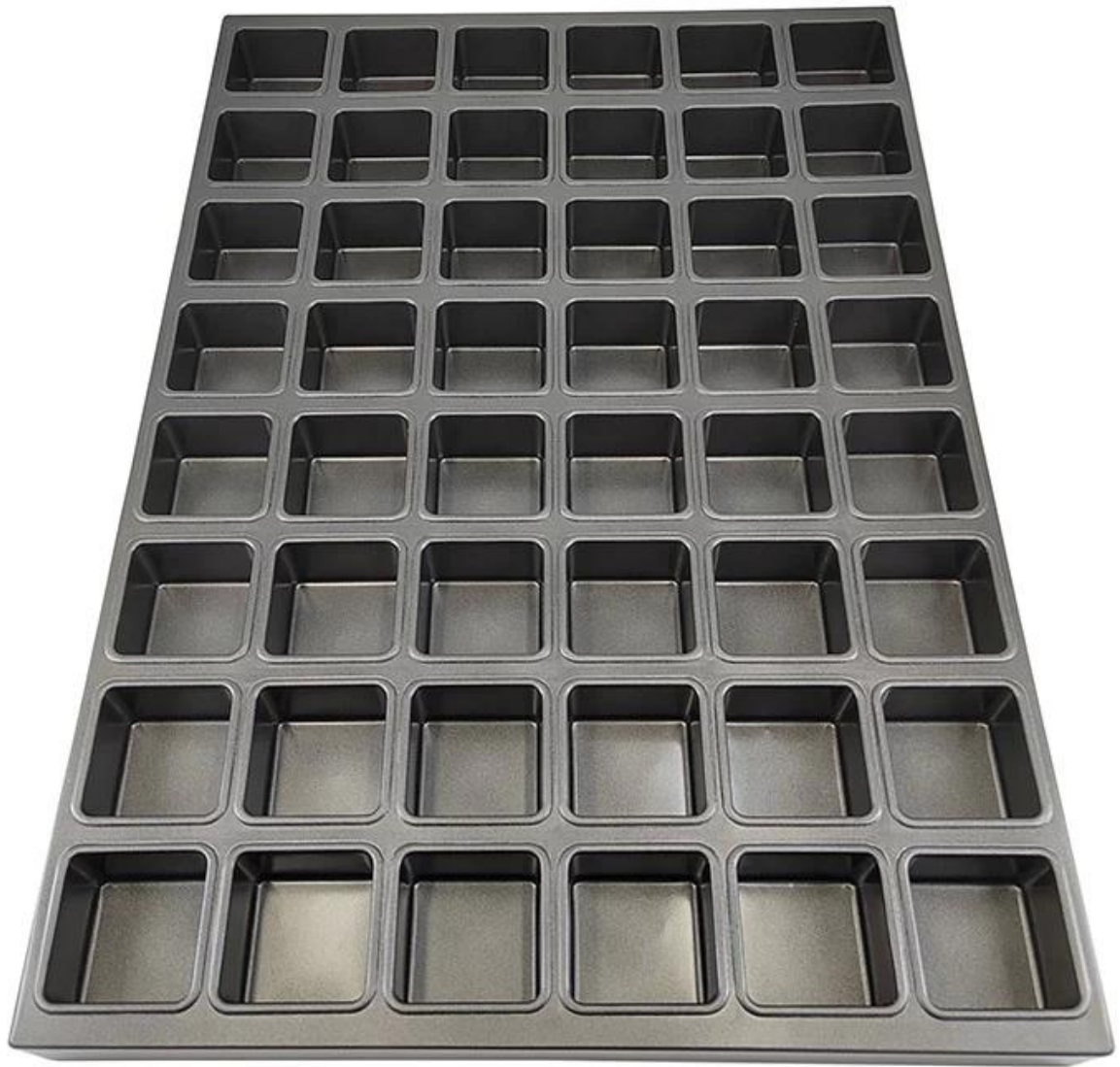
35-molds mini square cupcake muffin baking tray pan