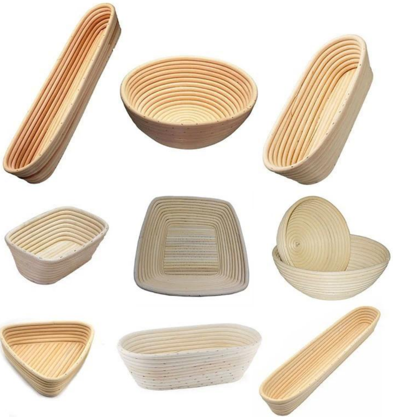
Banneton Basket Factory Pictures