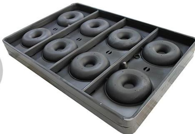
Large Donut Mold