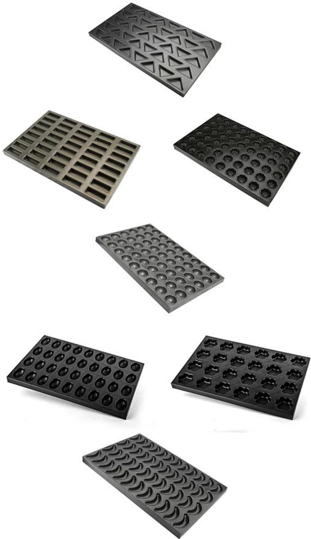
Factory pictures and customer visiting Tsingbuy customized baking tray