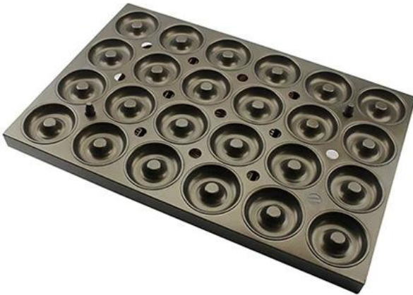
Shallow Donut Mold