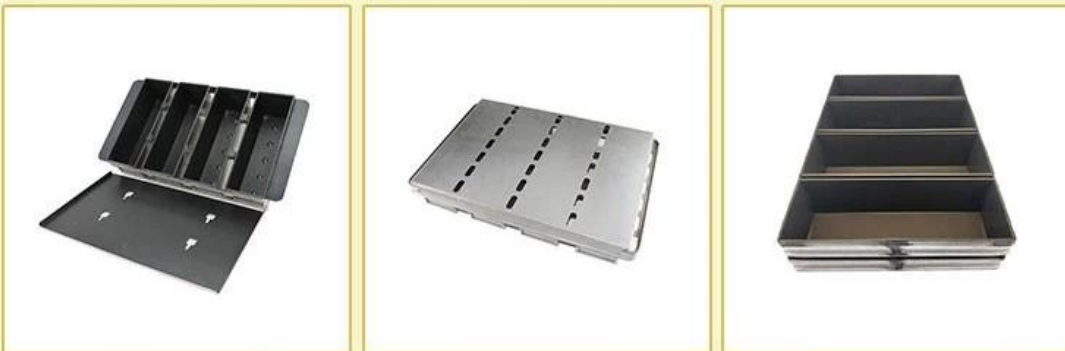
with buckled lid