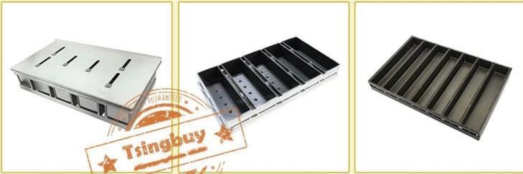
4/5 straps with lid

Available for food factory machinery lines