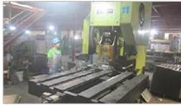
Automatic punching machine